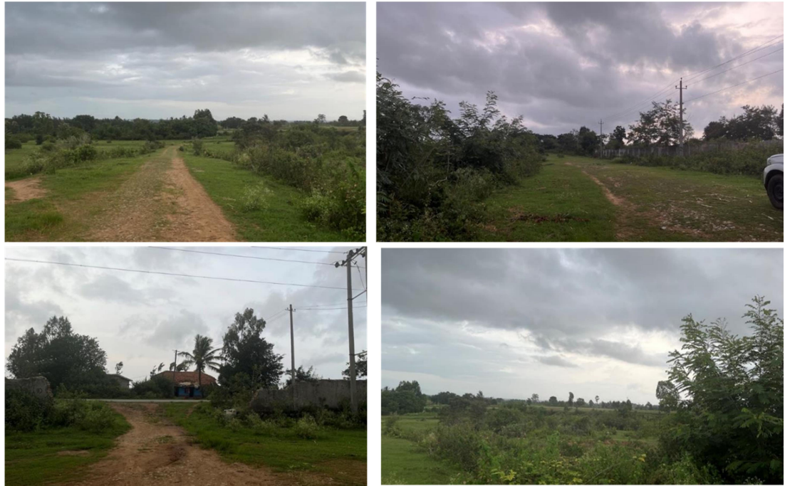
Fig: Site Pictures